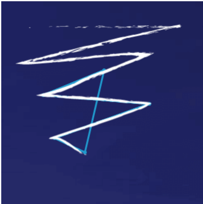
Storms and cyclonic winds

In a constant effort to offer its Customers advanced communication options, in 2017 the Enea Group launched an online chat on its website www.enea.pl . Alongside with the helpline and Online Customer Service, the chat offers a convenient way to contact Enea's consultants with general questions as well as queries about billing and payments, meter readings, or any customer service issues