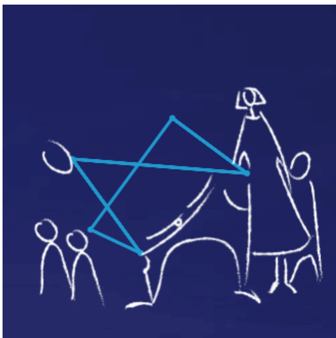
Enea joins the Big Family Card Programme

In 2017 the Enea Group became a member of Polski Autobus Elektryczny – łańcuch dostaw dla elektromobilności (Polish Electric Bus: The Supply Chain for Electromobility). The cluster aims to promote joint actions for the development of e-mobility in Poland, in particular electric buses and their components, based on Polish technologies. The collaboration between energy and automotive companies is meant to facilitate faster R&D and implementation. In particular, this includes developing an electric transit bus design with an improved efficiency achieved with better energy management, upgraded motor and battery, innovative methods of charging, and new standards of engineer training in e-mobility. With Enea as one of its members, the cluster will be able to work out systemic solutions to create the infrastructure for charging electric vehicles. Working to develop electromobility is one of Enea's strategic priorities, as the Group wants to build its potential on innovations in this field.