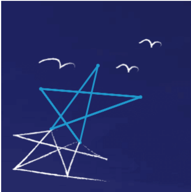
New Central Power Dispatch

Enea Akademia Talentów (Enea Talent Academy) is a scheme offering scholarships to talented primary and middle school students, as well as supporting state primary and middle schools with grants to implement programmes of student talent development. The scheme was offered in the regions where Enea operates. Each student scholarship amounted to 3000 zloty, while the grants came to 10 000 zloty each. The first edition lasted from September 2017 to January 2018. Twenty-two young people, 11 primary school students and 11 middle school students, were granted assistance in three categories: academic achievement, artistic achievement, and sporting achievement. Nine schools were awarded grants to implement interesting educational projects. The scheme will be continued in 2018.