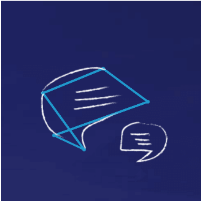
New online chat for Enea's customers

agreement with the Polish Ministry of Family, Labour and Social Policy. ENERGIA+ Rodzina (ENERGY+ Family) is Enea's new package dedicated to families with three children and more. The card comes with a range of discounts on recreational activities and other daily expenses, driving big families' cost of living down. Now, eligible families will be able to buy electricity for less.