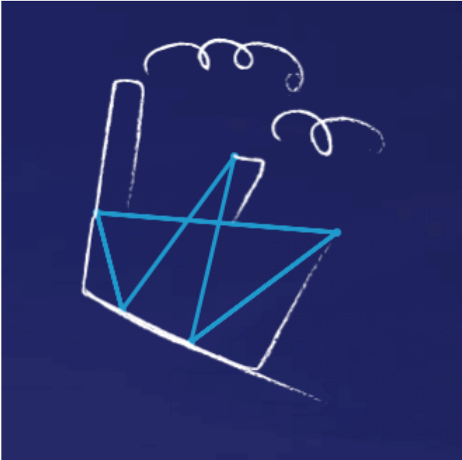
Enea Group acquires the Połaniec Power Station

and develop their business abilities (in technical and operational matters, law and administration, finance and accounting, HR, IT, and trade). The internships last for a year. Seventy percent of the participants of the first edition were offered jobs at Enea. The second edition welcomed another group of 16 interns.