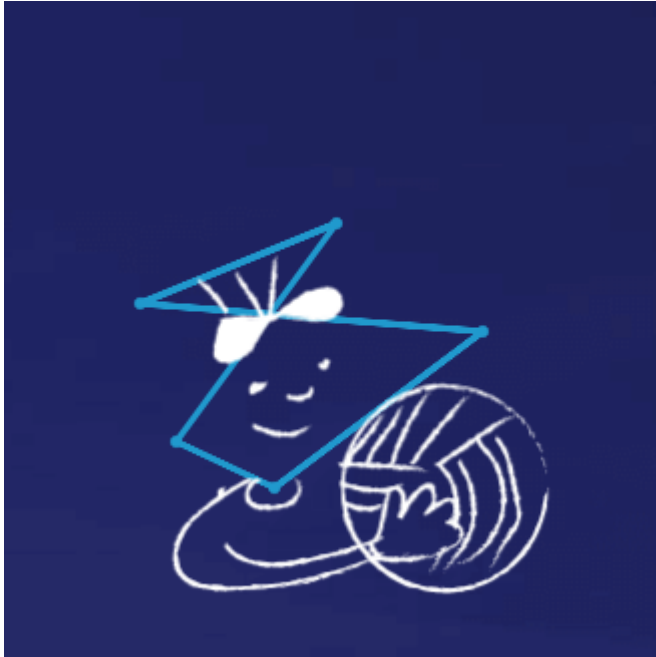
Enea Sports Academy

The Enea Foundation is a patron of Enea Akademia Sportu (Enea Sports Academy), a scheme that aims to promote physical activity and healthy lifestyle among children and young people in four provinces of Enea's distribution area. In 2017 over 3000 children participated in volleyball competitions and full body workout sessions as part of Enea Sports Academy. What is more, around 1000 children and youth from 30 schools in Poznań and its environs took part in the Enea Little Volleyball League.