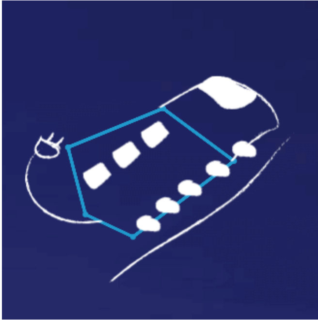
The electromobility cluster

In 2017 the Enea Group became a member of Polski Autobus Elektryczny – łańcuch dostaw dla elektromobilności (Polish Electric Bus: The Supply Chain for Electromobility). The cluster aims to promote joint actions for the development of e-mobility in Poland, in particular electric buses and their components, based on Polish technologies. The collaboration between energy and automotive companies is meant to facilitate faster R&D and implementation. In particular, this includes developing an electric transit bus design with an improved efficiency achieved with better energy management, upgraded motor and battery, innovative methods of charging, and new standards of engineer training in e-mobility. With Enea as one of its members, the cluster will be able to work out systemic solutions to create the infrastructure for charging electric vehicles. Working to develop electromobility is one of Enea's strategic priorities, as the Group wants to build its potential on innovations in this field.