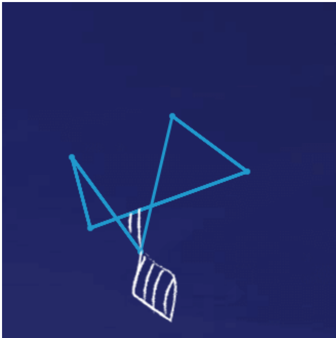
Install yourself at Enea, an internship programme

In 2017 the Enea Group launched a new 1075 MW supercritical power block at the Koźienice Power Station, which is the most advanced power unit in Poland and the largest coal-fired unit in Europe. It is also one of the most efficient systems of its kind in the world. As such, it considerably strengthens Poland's energy security. The advanced supercritical technology makes it possible to reduce CO 2 emissions by ca. 25% as compared to other existing black coal-fired power units.