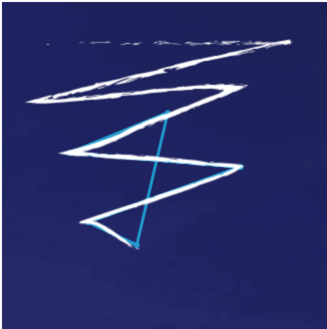
Storms and cyclonic winds

In a constant effort to offer its Customers advanced communication options, in 2017 the Enea Group launched an online chat on its website www.enea.pl . Alongside with the helpline and Online Customer Service, the chat offers a convenient way to contact Enea's consultants with general questions as well as queries about billing and payments, meter readings, or any customer service issues